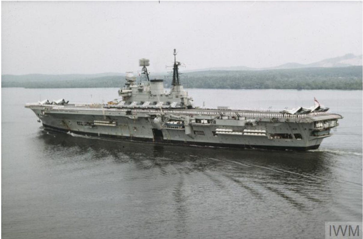
HMS Eagle Ships Shield