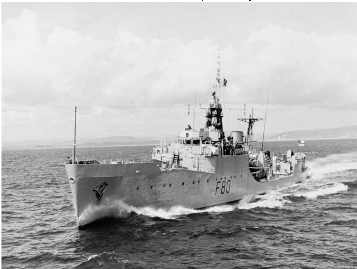
HMS Duncan (F80) - - Frigate

After her streamlining Artemis made a Training film Voyage North which included a diving sequence often used in television films. Two of her sister ships had more famous parts: HMS Andrew took part in a film of Neveille Shute's book On the Beach and HMS Aeneas featured in the James Bond epic You only Live Twice.