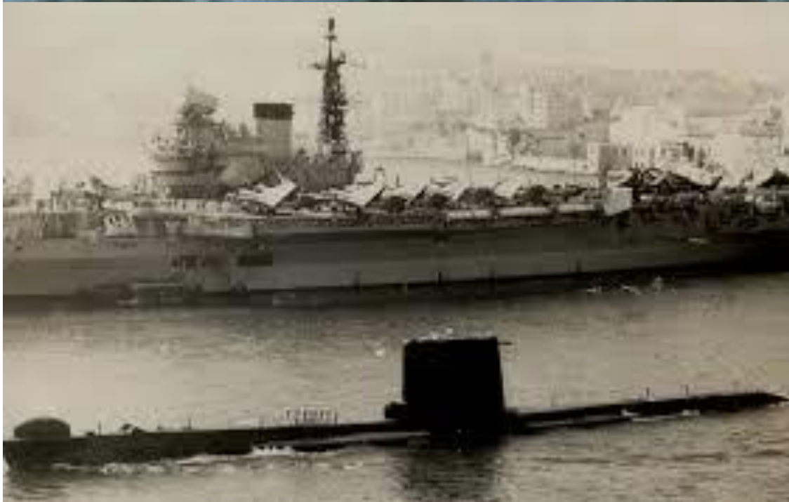
Artemis passing Eagle in Valetta Harbour in 1966 ( after failing to make it to the 1966 six day war between Israel and Egypt) Pa was on HMS Eagle at the time